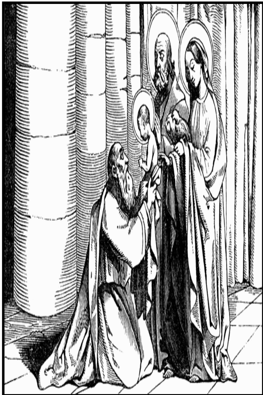
"The Presentation of Our Lord Jesus Christ in the Temple"