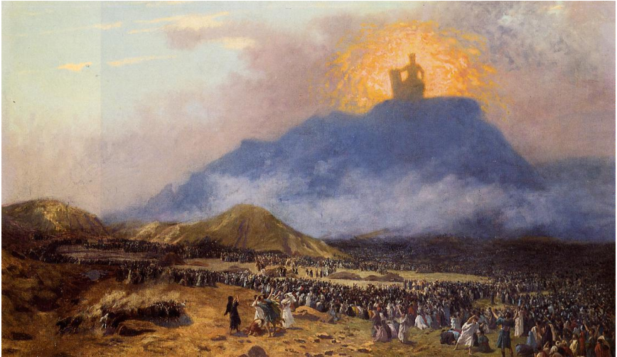
Moses on Mount Sinai

2 They had journeyed from Rephidim, entered the wilderness of Sinai, and camped in the wilderness; Israel camped there in front of the mountain. 3 Then