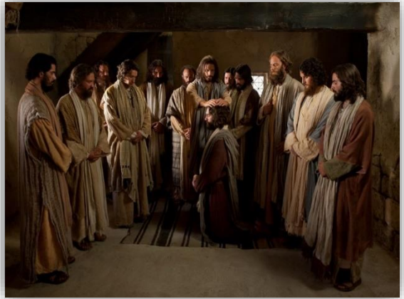
The Twelve Apostles

Simon, also known as Peter, and his brother Andrew; James son of Zebedee, and his brother John; 3 Philip and Bartholomew; Thomas and Matthew the tax-collector; James son of Alphaeus, and Thaddaeus; 4 Simon the Cananaean, and Judas Iscariot, the one who betrayed him.