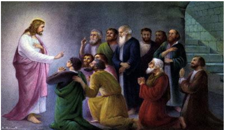
Jesus instructing his twelve disciples

7 As you go, proclaim the good news, "The kingdom of heaven has come near."