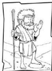
JOHN THE BAPTIST Matthew 3