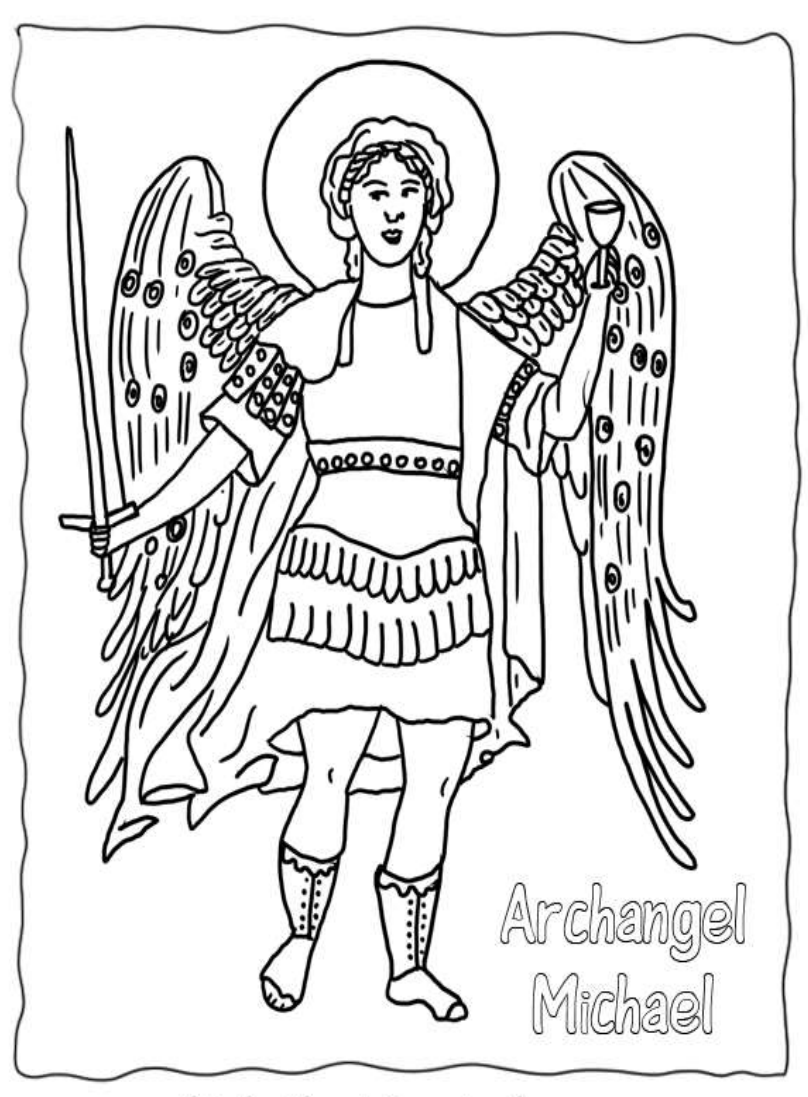
All about Angels @ angel-guide.com