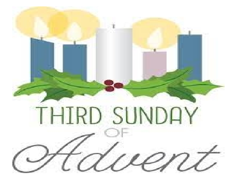
The Cathedral Church of